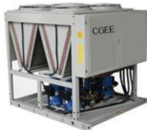
SMALL SIZE CGACDS SERIES CHILLER