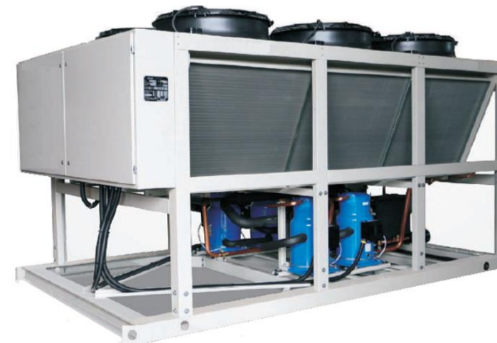
MEDIUM SIZE CGACDS SERIES CHILLER