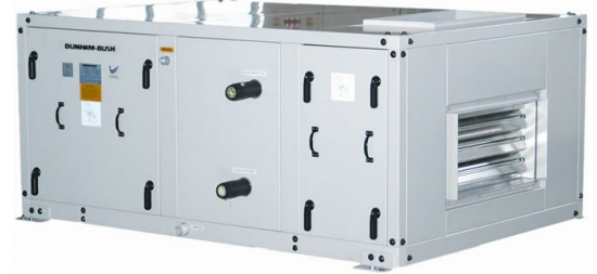
Modular Air Handler

High capacity DX coils can provide heavy dehumidification with several reheat options including: electric SCR, hot water and HGRH when used with a DX remote condensing unit.